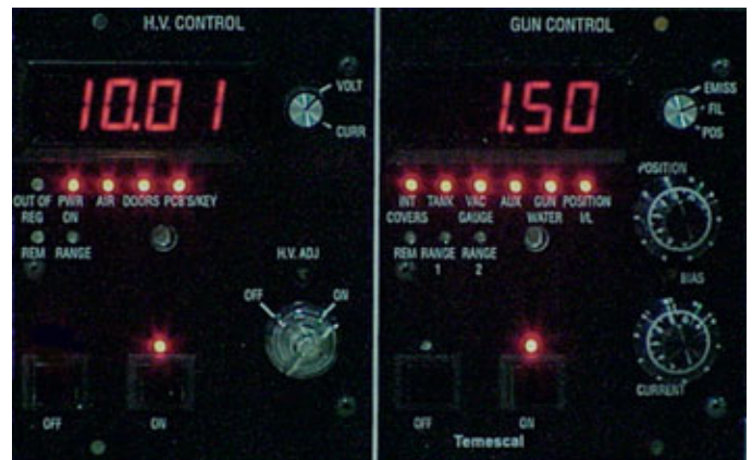
Simba 2 HV/Gun Controller

The basic remote controller consists of an HV Control panel and a Gun Control panel. HV controls include an HV ON/OFF keyswitch, HV ON and OFF switches, an HV adjustment pot, and a Local/Remote switch. The meter on the HV Control panel displays user-selectable HV or total power supply current. Gun controls include gun ON and OFF switches, emission and bias current controls, a Local/Remote switch, and a longitudinal coil current control. The Gun Control panel's meter displays user-selectable filament current, emission current, or longitudinal coil current. Multigun Simba 2 kits include a separate Gun Control panel for each additional e-beam gun.